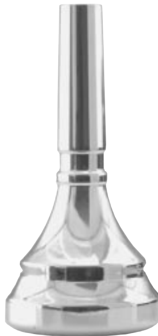
UMI Tuba Mouthpiece 17924AW

For the all-around player, UMI has developed its state-of-the-art UMI mouthpiece. A slight amount of mass around the cup results in a mouthpiece with exceptional performance characteristics. This additional mass keeps tonal vibrations from escaping through the wall of the cup, creating a mouthpiece that remains centered and focused, without the tone becoming too dark.