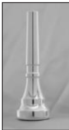
UMI Trumpet Mouthpiece 1703C